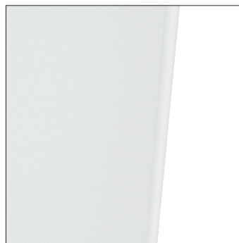
OP opal diffuser