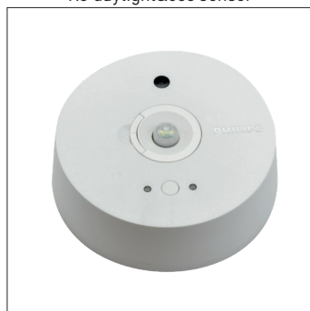
MCS wireless daylight&occ sensor