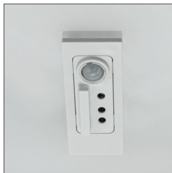
XC daylight&occ sensor

All current index numbers, lumen outputs, power consumption and many other technical information are available in our 2024 pricelist. Details on wireless lighting control systems on page number 896.